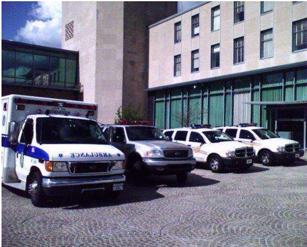
City of Bethlehem, LUEMS, and LUPD at Iacocca Hall for an Emergency Call

Muhlenberg College: Muhlenberg College operates 24/7 during the school year with one 2002 Chevy Blazer and multiple bike units. They have their own housing complex where they operate their service out of, providing a quick response of the entire crew. In addition, they use the services of a golf cart at standby events. They operate a Pennsylvania Quick Response Service identical to the certification that LUEMS has.